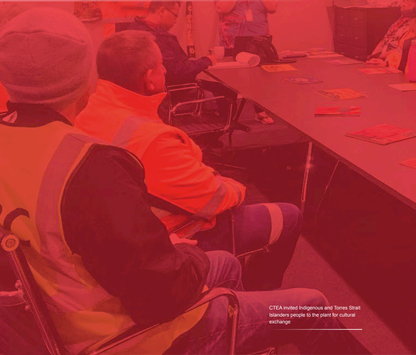
CTEA invited Indigenous and Torres Strait Islanders people to the plant for cultural exchange

Our success is reliant on being an excellent corporate citizen and good neighbour to the communities we operate in. Our goal is to facilitate community development through improving people's wellbeing, contribute to local employment and Sino-Australian cultural exchange.