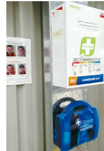
First aid kit in TEC Australia

We pay particular attention to the occupational health of employees at our production and commissioning sites. All hazardous chemicals in our plants have a Material Safety Data Sheet (MSDS), which records in detail the hazard level of the chemicals, their potential damage to humans, as well as storage measures and conditions, etc. In the production process, we require all employees that deal with hazardous chemicals to take strict protective measures. All production facilities are monitored on-site by safety inspection agencies to ensure that they are in line with the standards.