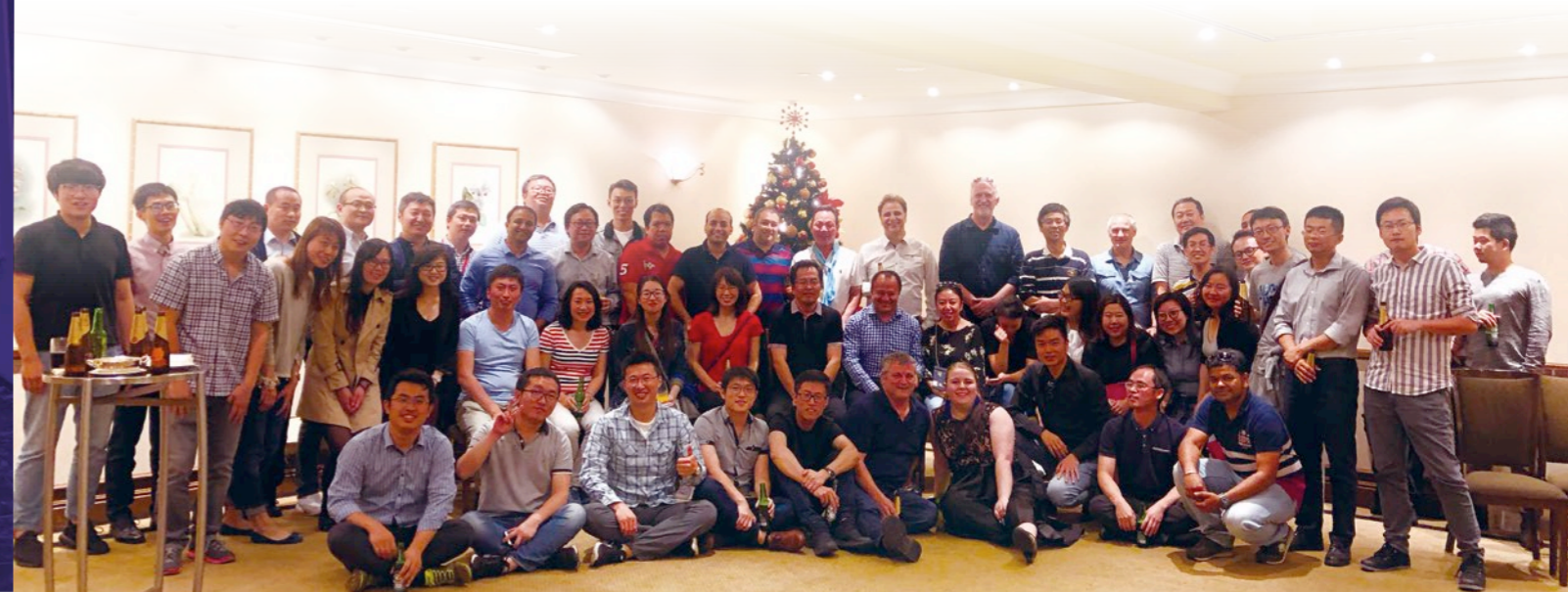
Team building of CRRC Changchun Australia