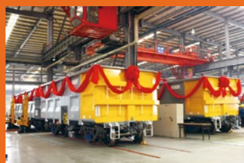
Delivery ceremony of the first batch of the Q-series 40t axle-load ore wagon produced by CRRC Qiqihaer