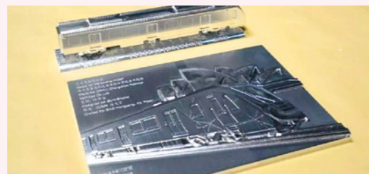
The model of the Melbourne HCMT Project sealed in a “time capsule”

In 2013, Warrnambool, a port city in southwestern Victoria, officially became sister cities with Changchun, the city where CRRC Changchun is based. On 27 May 2018, a ceremony was held to bury a “time capsule” to celebrate Warrnambool’s 100th anniversary. At the ceremony, the 3D model of the HCMT Project’s first train was placed inside the “time capsule”. The train was chosen to commemorate the strong tie Changchun has with the local community. It will be opened 100 years later as a witness to the friendship between the two cities. The model was painstakingly completed by the craftsmen of Changchun using the world’s most advanced aluminium alloy train body manufacturing equipment with more than 50,000 drive commands.