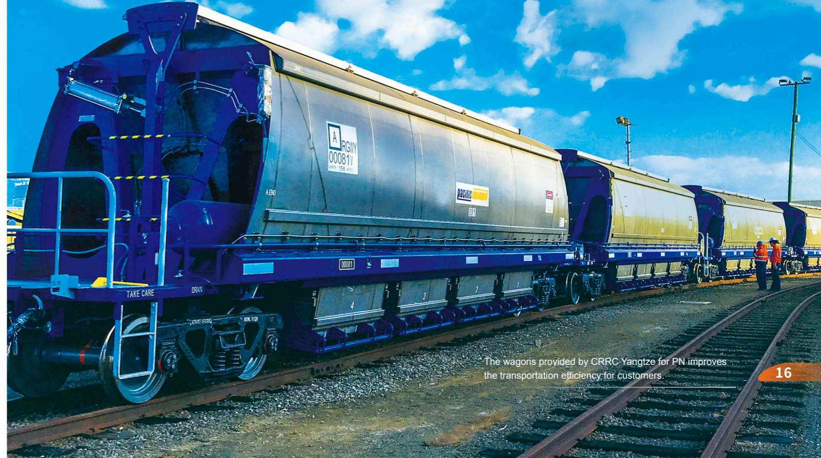
The wagons provided by CRRC Yangtze for PN improves the transportation efficiency for customers.

In May 2019, CRRC Yangtze received a letter of commendation from the commissioning manager of PN, an Australian rail freight company. In the letter, he expressed gratitude to CRRC for providing high-quality sugar transportation wagons and the efficiency of our delivery.