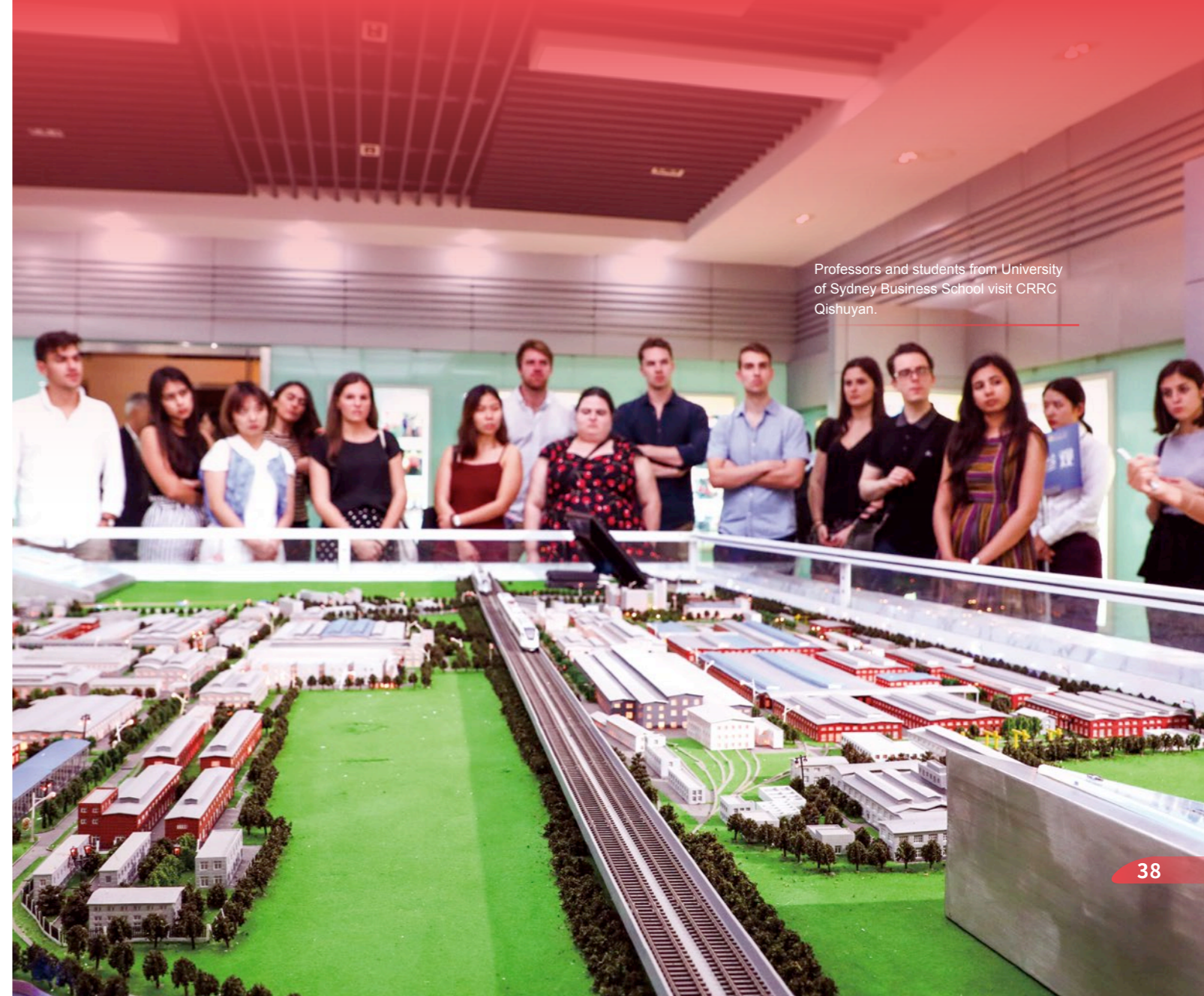
Professors and students from University of Sydney Business School visit CRRC Qishuyan.

The University of Sydney Business School