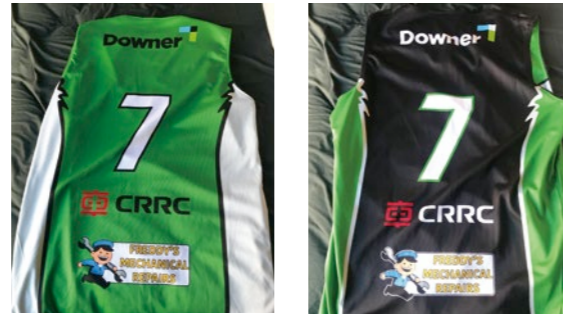
The home and away jerseys of the basketball team sponsored by CTEA and Downer