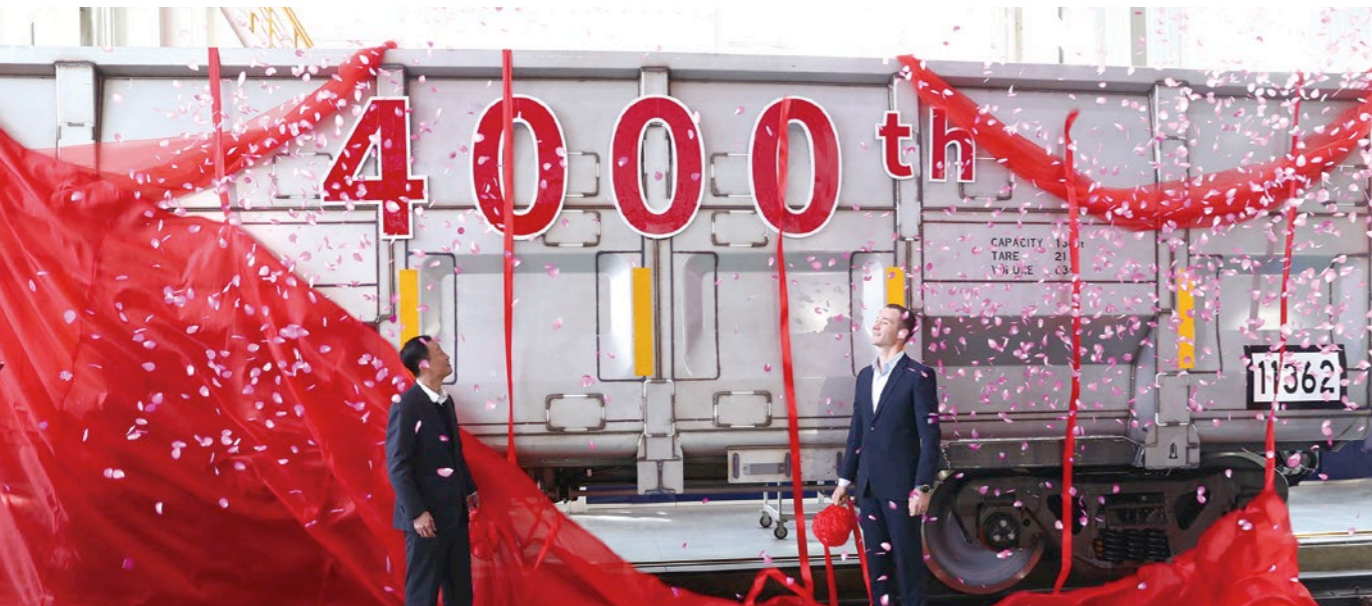
The completion ceremony held by CRRC Qiqihaer for the 4000th ore wagon for BHP Billiton

CRRC Qiqihaer has a world-leading wagon fatigue and vibration test-bed, which can obtain data from wagons up to 25-years old. Within 20 days, we can verify the reliability of wagons and can provide recommendations for future optimisation. At present, CRRC Qiqihaer has completed the fatigue test of 40t axle-load ore wagons for BHP Billiton through this test-bed.