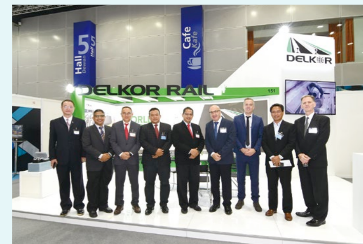
Delkor participates in the Rail Solutions Asia 2019 in Malaysia

In 2011, CRRC acquired Delkor, an Australian rolling stock spare and accessory parts manufacturing company but maintained Delkor's independence in business management. Through Delkor, CRRC provides all-round support for pricing, quality control, supply and communication to the rail industry. Delkor also participates in the overseas sales of CRRC products and has transformed itself from a self-serve model into a "production + trade" comprehensive model. The Delkor Egg baseplate has commenced the process to become a globally recognised product.