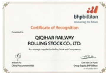
CRRC Qiqihaer becomes a strategic supplier of BHP Billiton

In the field of heavy-load transport, Australian mining and freight enterprises have a long legacy and high level. We strive to make technological breakthroughs, and continuously improve the local rail freight transport capacity with our advanced cargos.