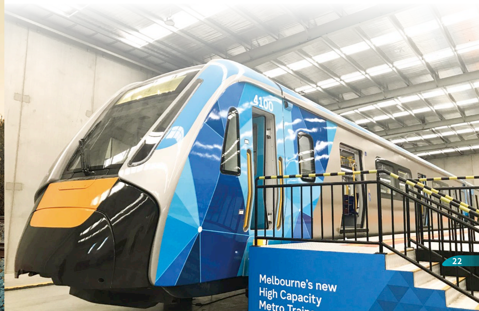
Melbourne's new High Capacity Metro Train

CRRC transfers advanced technology on spare parts manufacturing and provides training to local engineers and technicians, as well as local businesses. The bogie is one of the core components of rail trains and CRRC has contracted Hofmann Engineering Pty Ltd to assist with the welding and manufacture of bogies for the HCMT Project. Under the project requirements, CRRC needs to transfer all manufacturing techniques and quality control documents to Hofmann Engineering Pty Ltd, provide comprehensive support for the plant layout, acceptance inspection of tooling, employee training, and carry out the comprehensive evaluation to guarantee the products' quality. After systematic training, Hofmann Engineering Pty Ltd has enhanced its understanding of the welding and manufacture technique of the bogie frame. Its production capacities have also been improved.