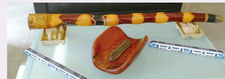
Aboriginal and Torres Strait Islander artifacts exhibited at CTEA

CTEA respects multiculturalism. The company hires employees that identify as Aboriginal and Torres Strait Islander, and celebrate cultural initiatives like NAIDOC Week in July, where we aim to increase awareness about Aboriginal and Torres Strait Islander culture.